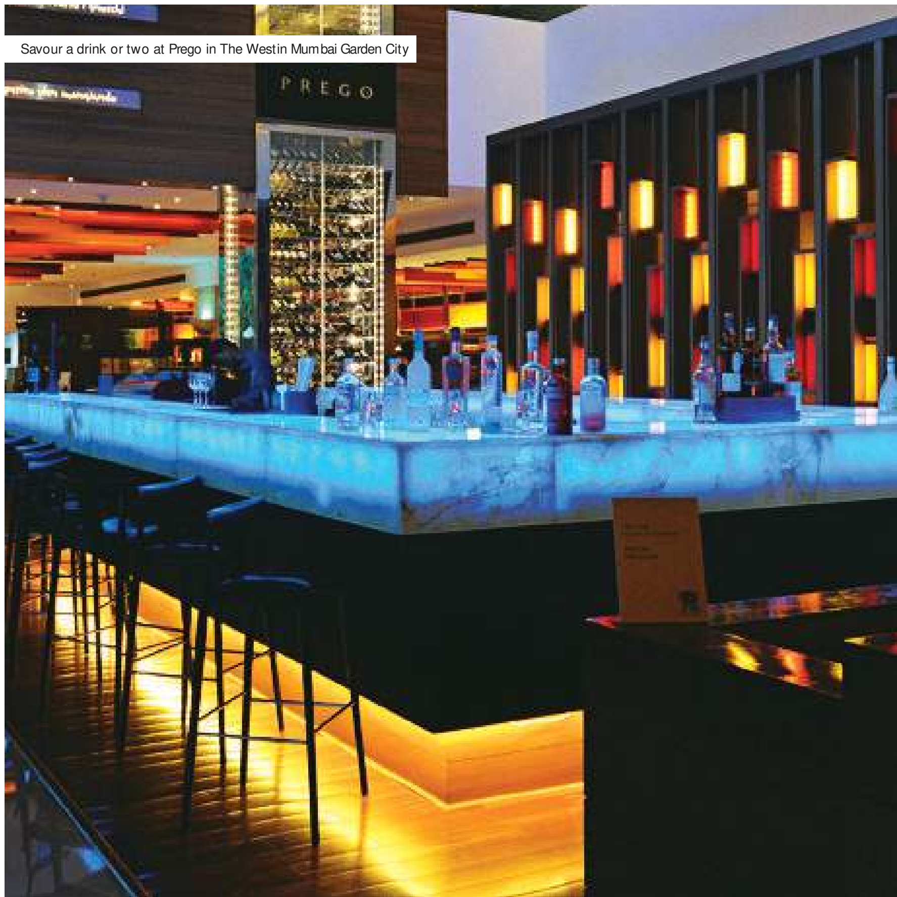
Savour a drink or two at Prego in The Westin Mumbai Garden City